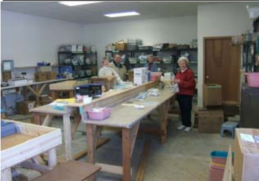
Volunteers at work in the new sorting room. More space allows for safer and more effective processing of supplies and donations.