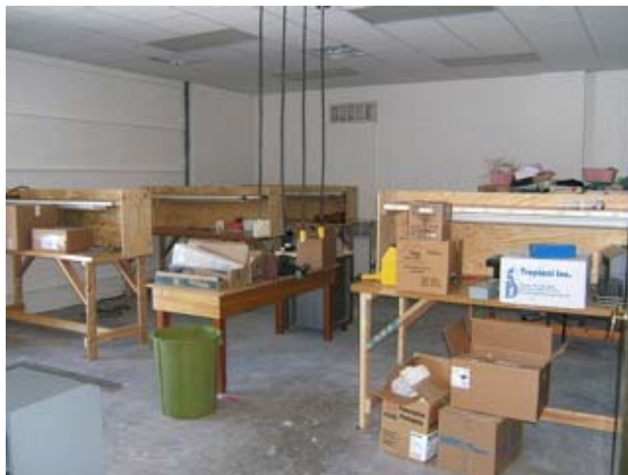
Volunteer biomedics will evaluate and repair medical equipment in their new room

it is that people who return from mission trips regularly testify to the spiritual enrichment they have gained from their sojourns among the poor? "How is it," they often ask, "that I could have received so much from those who have nothing to give?" Well, the answer, it seems, is that those who have no worldly possessions or power are apt to offer great spiritual treasures precisely because, having nothing but faith to live by, they are natural and expert witnesses to the trustworthiness of our gracious God. They are often our joyful guides to life by faith as the path to abundant life. And it is above all the