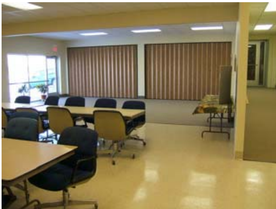
Newly expanded conference/break room showing ramp to warehouse on right side

Dietrich Bonhoeffer once wrote that in order to know what faith is all about, you have to dive into life, with the challenges and risks of our times, reaching out with your best to engage the people who populate our world, where failings and temptations abound, but also glory and joy, enough to be regularly thrown to your knees by the experience to seek and to celebrate the grace of God. Bonhoeffer could have written this about our commitment to grow in mission because, in every respect, it has been a matter of faith and a source of blessing. Have you ever wondered why