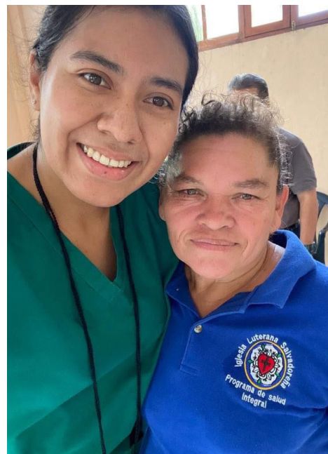
Training and supporting volunteer health promoters for their community-based work