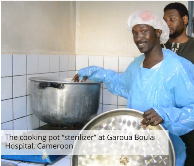
The cooking pot “sterilizer” at Garoua Boulai Hospital, Cameroon

means that private Lutheran hospitals receive very small pay for healing services. Although the three main hospitals pay their employees on time today (a major achievement), none of them can afford to replace their worn-out sterilizers. Two use a cooking pot to boil and sterilize surgical instruments. But this is slow and requires expensive fuel. A large professional sterilizer would dramatically change the situation, consuming less fuel and efficiently sterilizing much, much more. Combined, these hospitals could average over 3,000 surgeries a year, a significant increase that would bring sorely needed revenue to each hospital. Poverty is the fundamental challenge, but in February, 2024, GHM is partnering to offer a new sterilizer to each hospital, creating new capacity to serve surrounding communities. Two containers a year, full of vital medical supplies, are also part of how GHM is partnering today in Cameroon.