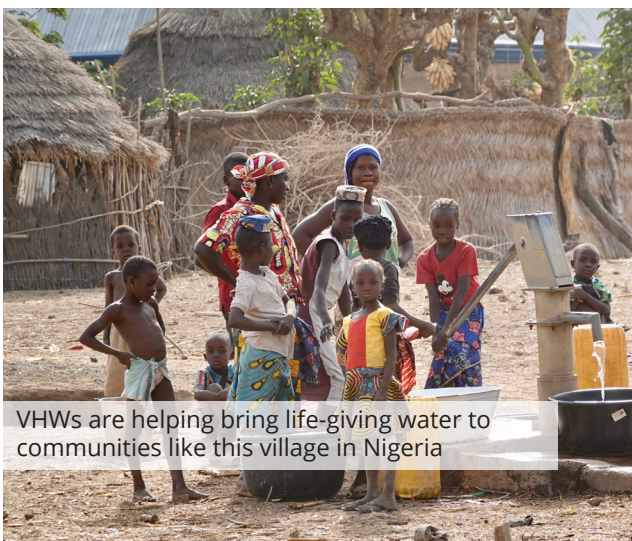
VHWs are helping bring life-giving water to communities like this village in Nigeria

Effective management is fundamental to having strong and sustainable health systems. To this end GHM has been invited to consult with national leadership in both Cameroon and Madagascar . In Madagascar, a conference in January, 2024, brought together almost 100 top leaders from the Malagasy Lutheran Church (FLM), the Lutheran health system (SALFA) and each of the SALFA hospitals. At the request of these local leaders, GHM is consulting to bring increasing sustainability and quality of care in that system. In Madagascar and Cameroon, and many other countries where GHM partners, the Lutheran healthcare efforts collaborate with government healthcare systems to deepen and extend healthcare beyond what the government can do alone.