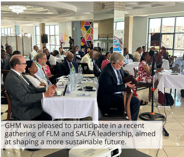
GHM was pleased to participate in a recent gathering of FLM and SALFA leadership, aimed at shaping a more sustainable future.

means that private Lutheran hospitals receive very small pay for healing services. Although the three main hospitals pay their employees on time today (a major achievement), none of them can afford to replace their worn-out sterilizers. Two use a cooking pot to boil and sterilize surgical instruments. But this is slow and requires expensive fuel. A large professional sterilizer would dramatically change the situation, consuming less fuel and efficiently sterilizing much, much more. Combined, these hospitals could average over 3,000 surgeries a year, a significant increase that would bring sorely needed revenue to each hospital. Poverty is the fundamental challenge, but in February, 2024, GHM is partnering to offer a new sterilizer to each hospital, creating new capacity to serve surrounding communities. Two containers a year, full of vital medical supplies, are also part of how GHM is partnering today in Cameroon.