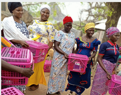
Village Health Workers with Birthing Assistant Kits, Nigeria

And the one who was seated on the throne said, 'See, I am making all things new.' Revelation 21:5