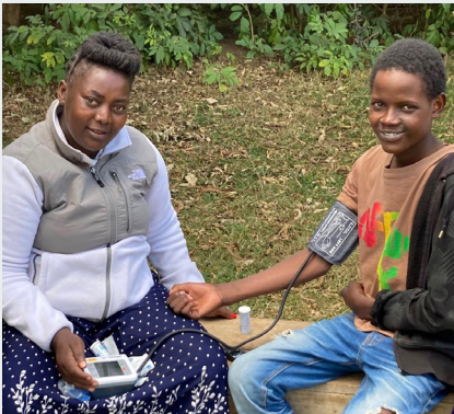
Community Health Worker training, TZ

Health workers are special people. Often they choose this career because they are genuinely seeking ways to improve people's lives, to change the world. Many associated with GHM are intentionally