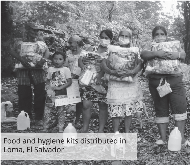
Food and hygiene kits distributed in Loma, El Salvador

an Center for Reconciliation can use to create masks. These medical masks are not N95 grade but are significantly better than homemade cloth masks, and offer a new, creative solution to the dwindling availability of N95 masks. We hope to replicate this effort in many countries.