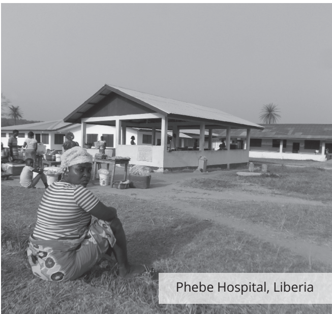
Phebe Hospital, Liberia

While PPE and community health workers have been GHM's priorities for support so far, this response may ultimately be only a first phase. The evolving challenges will demand that GHM remain nimble in helping our partners find creative solutions over the next year or more.