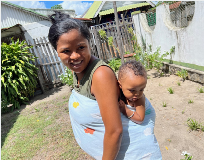
Mother and child, Manambaro, Madagascar

Moms have an outsized influence on their children - physically, spiritually, emotionally. In fact, research reveals the health of mothers is an indicator of global health as a whole. A healthy mother can take on educational