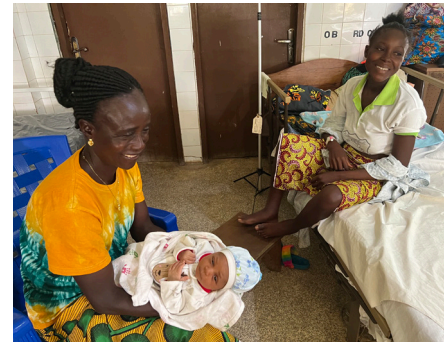
Three generations, Curran Lutheran Hospital Maternity Ward, Liberia